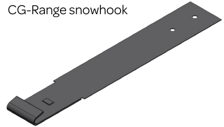
Designer range snowhook