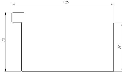
Sizes shown are for our standard Archie box product